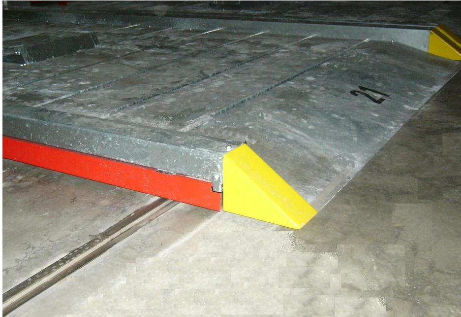
Platform with end cap, ramp, guide rail, safety bar

Well sized sheet metal construction. Platform fully plane and dewatered, equipped with 2 guiding rollers (front side) and 3 heavy duty plastic rollers (rearside), securing silent moving. Coloured end caps and a flexible ramp secure easy and comfortable parking. Adjustable wheel stopper for easy car positioning. Power supply with travelling cable from ceiling.